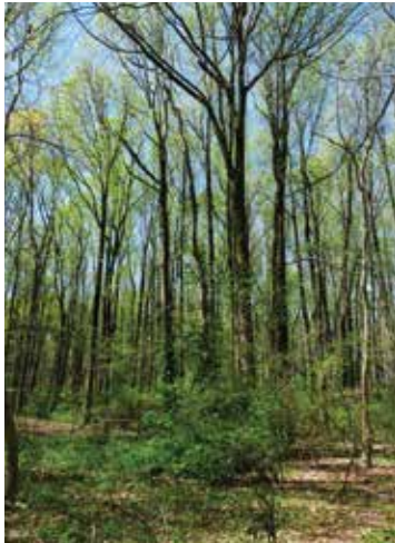
Figure 2. Study site looking west uphill. [Photo by A. Greller: 4/17/2012]

debris and leaf litter were removed and a measured sample was taken using a slide hammer and removable cylinder for the calculation of bulk density. An additional sample was then taken at each site and bagged separately for the determination of pH and detailed soil composition through soil hydrometer analysis.