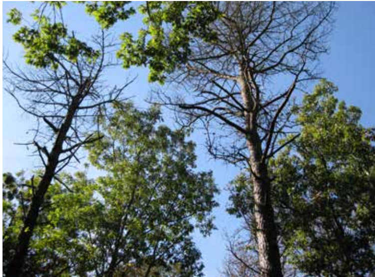
Dead and dying pitch pines at the William Floyd Estate, Mastic Beach, Long Island. October 9, 2014.