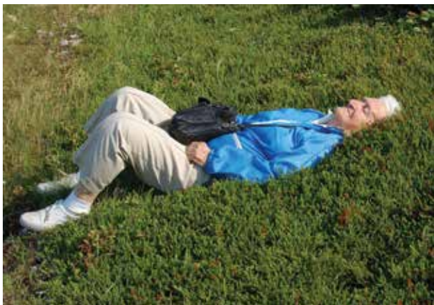
Relaxing on the Newfoundland trip, 2006.