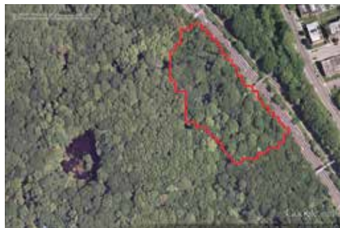
Figure 3. Study site outlined in red, Decodon Pond on the left.

One hundred and eleven trees (16 species) were measured. Of these, 48 percent of the F. americana appeared to be dead, and all living specimens were in various stages of decline. No dead trees of any other species were found in the sampling site. The importance values (IV) for all trees at the site (Table 1) show Fraxinus americana to be the most important species with an IV of 25.84, a value very close to that of Liriodendron tulipifera with an IV of 24.67. The third most important species is Betula lenta , with an IV of 7.03, making F. americana and L. tulipifera co-dominants in the stand. Only two oak species, Quercus rubra and Q. velutina (black oak) were present, while the other components include hydrophilic species such as Acer rubrum (red maple), Betula lenta , Platanus occidentalis (American sycamore), Liquidambar styraciflua and Carpinus caroliniana (American hornbeam), suggesting that a mixed hardwood swamp forest is present within the site.