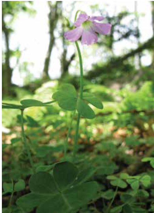
Figure 7. Oxalis violacea , Violet Wood Sorrel.

While Taylor noted the presence of bunch broomsedge ( Andropogon glomeratus ), a wetland edge species, he apparently did not find A. virginicus (broomsedge) and that is most certainly attributable to the absence of this species on eastern Long Island at that time. It has since become very common in East Hampton Town including Montauk. Its plumose seeds are dispersed in