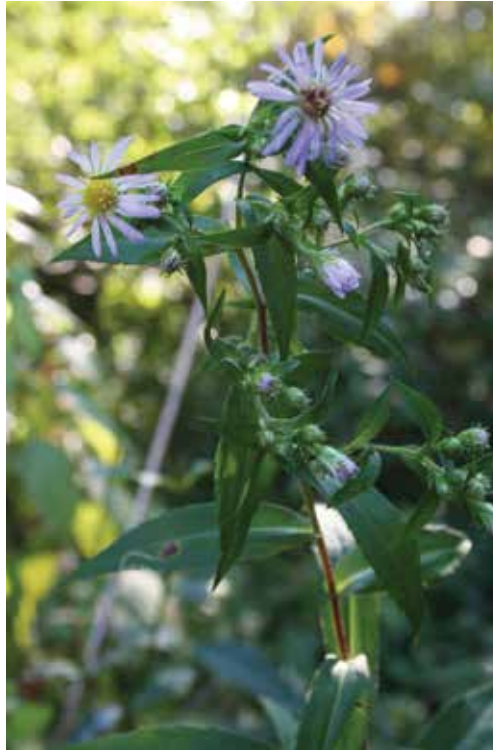
Figure 3. Symphyotrichum puniceum , Purple-stemmed Aster.

Taylor was well aware of the very fine work, The Geology of Long Island , authored by Fuller and published in 1914 by the U.S. Geological Service. He frequently alluded to the glacial origin of Montauk, the makeup of the different soils associated with woodlands, heathlands and dunelands, and particularly the kettle holes which were so many, so diverse, and unique in their floras. What he didn't know was that much of the land under those kettle holes and under the Downs in general contained clayey soils and aquicludes of clay that were nearly impenetrable to percolating precipitation, thus providing vernal and seasonal wetlands of many different kinds today called "perched" wetlands, some of which were long-standing and others of which were ephemeral and only wet for a very short part of the year. At the time of Taylor's study the true water table in many wetland situations lay well below the bottom of the wetland, except for in the largest ponds---Fort Pond, Great Pond, Oyster Pond,