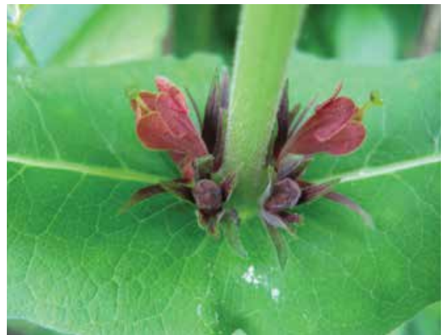
Figure 4. Triosteum perfoliatum , Perfoliate-leaved Horse Gentian.