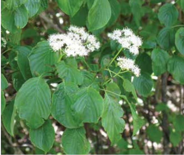
Figure 5. Swida alternifolia , Alternate-leaved Dogwood.

On the other hand, some species that Taylor listed as common, no longer are: to wit, sandplain gerardia ( Agalinis acuta ), water-plantain ( Alisma subcordatum ), wild sarsaparilla ( Aralia nudicaulis ), pearly everlasting ( Anaphalis margaritacea ), gray birch ( Betula populifolia ), Virginia chainfern ( Woodwardia virginica ), seabeach sandwort ( Honkenya peploides ssp. robusta ), cranberry ( Vaccinium macrocarpon ), bartonia ( Bartonia virginica ), mermaid-weed ( Proserpinaca pectinata ), meadow-beauty ( Rhexia virginica ), golden-pert ( Gratiola aurea ), rose milkwort ( Polygala sanguinea ), and Canadian burnet ( Sanguisorba canadensis ). It should be noted that of the above-named species, sandplain gerardia is federally- and state-endangered, and mermaid-weed is state-threatened.