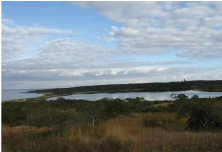
Figure 2. Eastward view from Squaw Hill, east of Big Reed Pond.

Peconic Land Trust have worked with the federal, state, county and town governments to acquire another 5,000 or so acres for public use. Lately, money accumulated in the town's Community Preservation Fund established by referendum in 1998 and funded by a special tax on real estate sales, has been used to purchase much of Montauk's open space. The very "Point" and the lighthouse, federally owned since 1804, were given to the Montauk Historical Society early in the new millennium. A