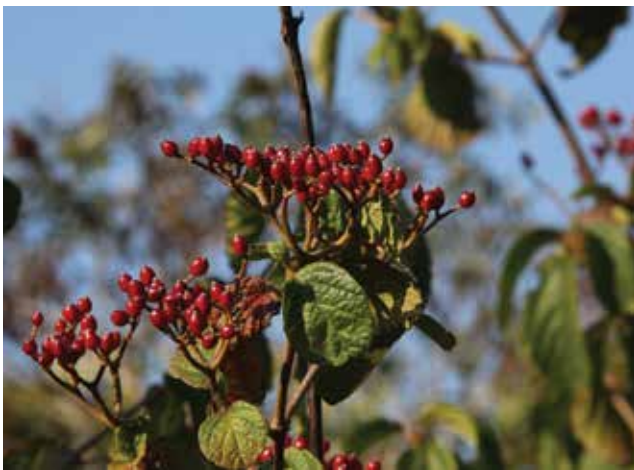
Figure 8. Viburnum dilatatum , Linden Arrowwood.

The 600-plus species of higher plants now documented for Montauk are largely due to the influx of invasive plants, of which Taylor mentioned only a few. It is expected that the invasive-to-native species ratio will continue to move in favor of the invasives in future years as Montauk is a bustling area with lots of coming and going, particularly tourists and second homers, as well as the Long Island Railroad and its passengers, buses and various boats from yonder points. Ornamentals are popular and the garden industry is thriving. Montauk’s fauna, particularly its large white-tailed deer population and increasing wild turkey population, is also affecting the condition of Montauk’s flora. Invasive and native poisonous plant species will probably increase in number at the expense of the more edible ones.