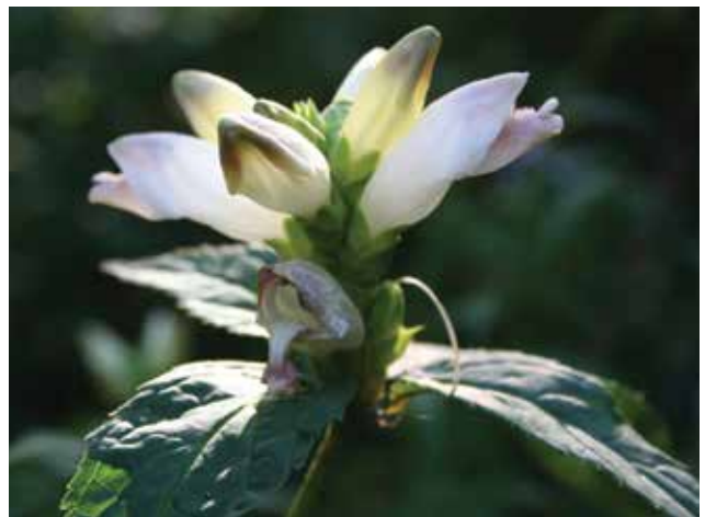
Figure 6a. (top) Lilium philadelphicum , Wood Lily and Figure 6b. (bottom) Chelone glabra , White Turtlehead.

enrod ( Solidago speciosa ), blue wood aster ( Symphotrichum cordifolium = Aster cordifolius ), showy aster ( Eurybia (= Aster ) spectabilis ), wild pink ( Silene caroliniana [var. penyslvatica ]), coontail ( Ceratophyllum demersum ), water milfoil ( Myriophyllum humile ), mermaid-weed ( Proserpinaca pectinata ), mountain-mint ( Pycnanthemum incanum ), common bladderwort ( Utricularia vulgaris ssp. macrorhiza ), and water starwort ( Callitriche heterophylla ).