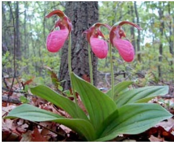
Figure 1. Cypripedium acaule (Pink Ladies' Slipper)

Orchids, as a group, are tough, and though adapted to specific environmental conditions, can still be found in suitable habitats throughout the region. Contrary to common belief, some species are not shy about growing in damaged environments; in fact some specialize in colonizing disturbed areas. I have seen them poking through gratings of abandoned shopping carts, and growing along streams no one would dream of drinking from. I've even seen them "mixing it up" with Phragmites and porcelain berry. These are by no means ideal situations, and in many cases are merely examples of transitions from one