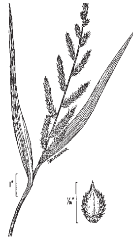
Fig. 3 Echinochloa crus-galli (L.) P. Beauv. - barnyardgrass USDA NRCS. Wetland flora: Field office illustrated guide to plant species . USDA Natural Resources Conservation Service.

Fall panicum ( Panicum dichotomiflorum ). This is also a tall one, blooming in late summer, found mostly in the meadow. The genus Panicum has many species in our area, and the use of “panic grass” as a common name gave me a lot of trouble at first. The genus as a whole is distinguished by small oval flower clusters (florets) borne singly at the end of the branches. Once you have seen a few, this becomes clear.