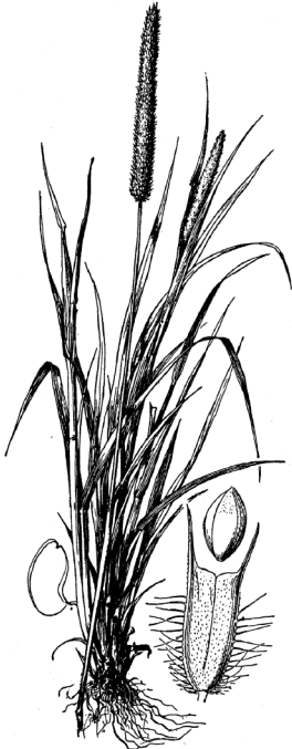
Fig. 2 Phleum pratense L. - timothy Hitchcock, A.S. (rev. A. Chase). 1950. Manual of the grasses of the United States . USDA Miscellaneous Publication No. 200. Washington, DC. 1950.

Timothy ( Pbleum pratense ). Figure 2. I find it in early summer north of the Equestrian Center. The cylindrical inflorescence is stiff compared with foxtail (which blooms later).