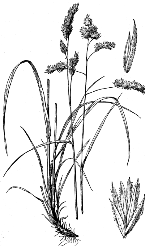
Fig. 1 Dactylis glomerata L. - orchardgrass Hitchcock, A.S. (rev. A. Chase). 1950. Manual of the grasses of the United States . USDA Miscellaneous Publication No. 200. Washington, DC. 1950.

RUSH stems are usually wiry and round in cross-section. We have lots of path rush ( Juncus tenuis ) along the Muttontown paths.