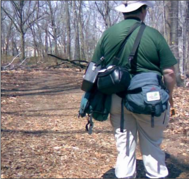
This Field Botanist is Prepared for Anything!!