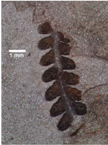
Cyathea sp. (Durso/Bennington)

Fossil Cyatheaceae are known from the New York area from 86 mya through to the Miocene of New Jersey (Rachele, 1976). Sporangia are scarcely visible on the Durso/Bennington specimen. I present a comparison with a living Cyathea (above right). The similarity strongly suggests the fossil belongs in the genus Cyathea . Hollick (1906) lists for our area four species of the Cyatheaceae genus Thyrsopteris . In the Durso/Bennington specimen the pinnules differ from one portion to another; the leaflets (pinnules) are either directly attached to the midrib (rachis) or they are attached by a shallow wing (pinnatifid) and resemble those of the modern species Cyathea multiflora .