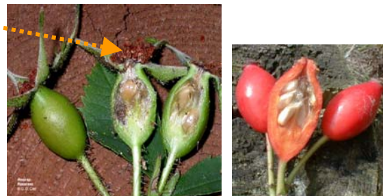
Rosa canina fruit (hip): immature (left), mature (right).