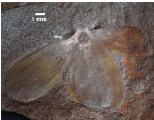
Tricalycites major Hollick (Durso/Bennington)

1. Winged dispersed scale, identified as Tricalycites major Hollick, a part of the female cone of an extinct species of the conifer family Cheirolepidaceae, possibly in the genus Frenelopsis .