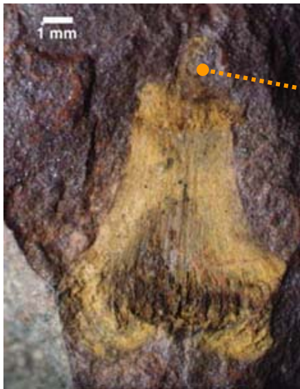
Rosa sp. (Durso/Bennington)

This fossil (top left) appears to be a medial longitudinal section of a young rose ( Rosa sp.) fruit. The wall (hypanthium) is thick, and the remains of the flower parts appear to be present at the top. It is the presence of these floral remnants that distinguish a rose hip from a fig ( Ficus ) synconium. Seeds are not clearly visible in the dark central cavity, suggesting an immature fruit specimen. In the cavity there is a hint of inter-ovulatory hairs that project apically from the base. Mature fruits of Rosa canina are presented at the