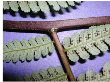
Cyathea multiflora