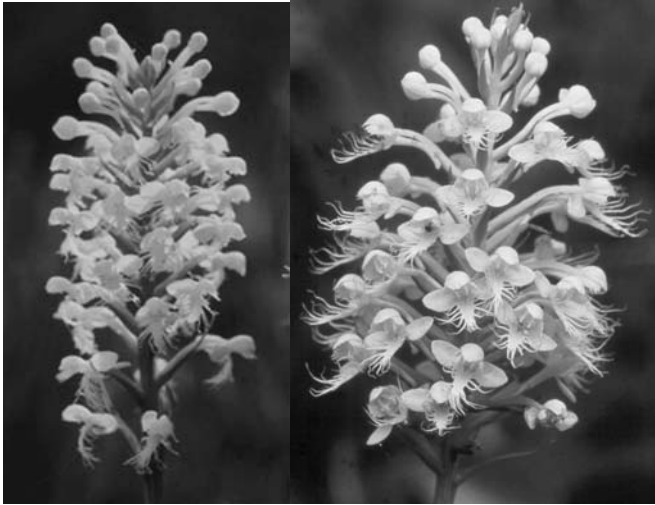
Figure 2a. Platanthera pallida (left), 2b. Platanthera cristata (right).

During the past twenty-five years many new species have been described that were segregated from more widespread and familiar species. If the morphological descriptions of those traditional species are still relied upon they usually are found to contain criteria that are distinctive to the more recently described species, e.g. Platanthera pallida within P. cristata . Some excellent examples are cited below.