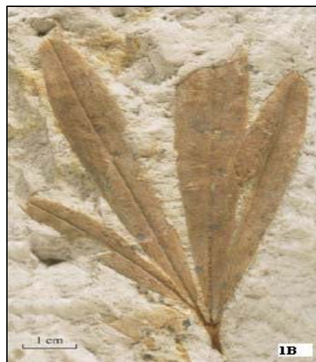
Figure 1B. Dewalquea gelindensis Paleocene of Limburg, Belgium: to show a nearly complete leaf.