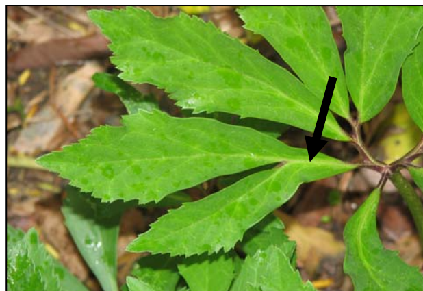
Figure 3. Helleborus niger leaflets; arrow points to area of fusion of two leaflets (A. M. Greller, 28 May 2007).