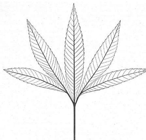
Figure 2. “Restoration of Devalquea smithii Berry (1919)” (Cornet 2007).