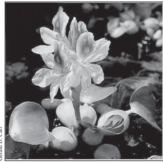
Water Hyacinth: (Eichhornia crassipes)

Water Hyacinth: Zy Proly reported that the Water Hyacinth ( Eichhornia crassipes ) that came in last fall at Scudder's Pond in Sea Cliff does not appear to have survived the winter. As of this April it was missing.