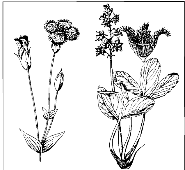
Roy Latham collected Fringed Gentian, Gentianopsis crinita (left) and Buckbean, Menyanthes trifoliata var. minor , from Oyster Pond at Montauk. No populations of either species are currently known from Long Island.

I used to consider the interrupted fern was found in all localities from Orient west and east to Montauk. As I recall it was more common than the cinnamon fern in the Greenport woods in places. Woodsia obtusa used to be near Greenport, but the spot was destroyed during the World War; I had a specimen in my collection, now in Albany. Adiantum was the rare one on the east end, I collected it from Southold, Sag Harbor and Shelter Island. I had four stations for Ophioglossum vulgatum : one at