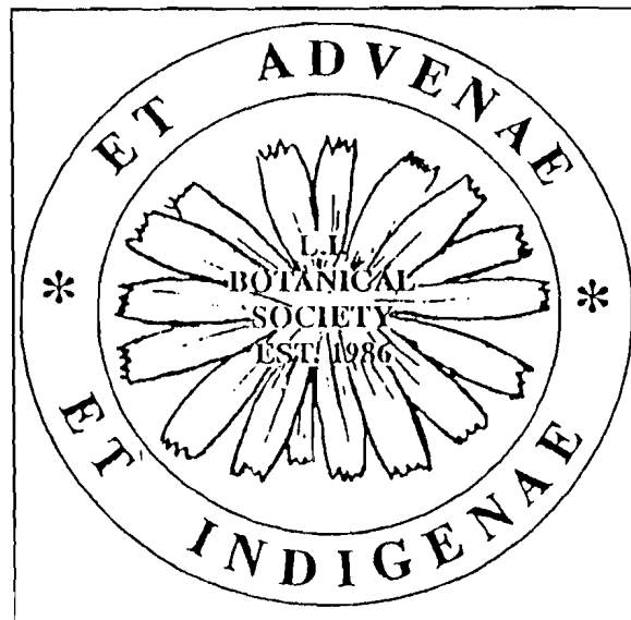
LIBS LOGO? #3