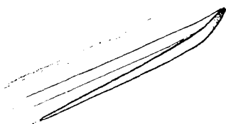
Typical Poa leaf

First: When you suspect you have a Bluegrass, check the leaves (please note: leaves - plural; just one is never safe). Hold a fresh leaf between your thumb and